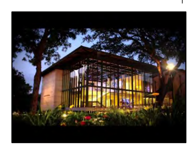
HEB Canopy Moved to New Location for Use by Residents