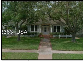
221 N 2 nd