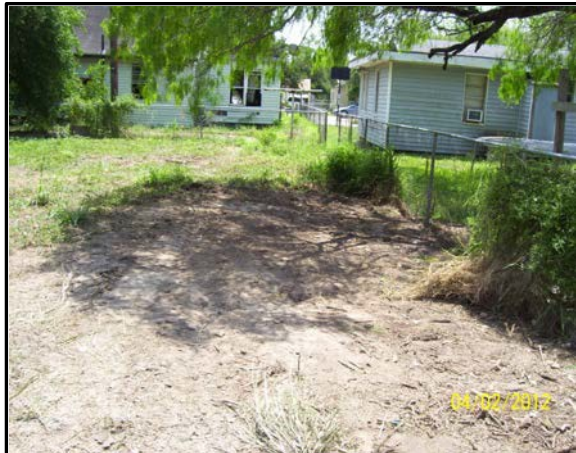
1600 Young Drive