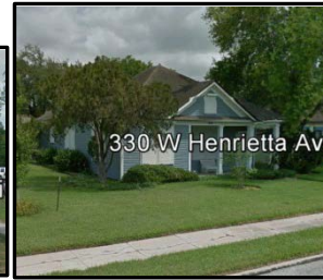
330 W Henrietta