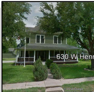
630 W Henrietta