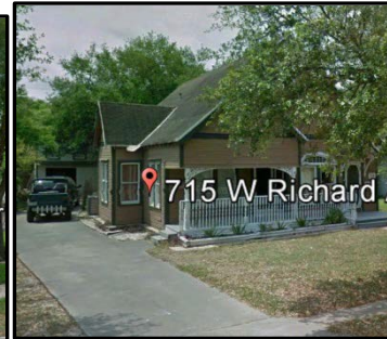
715 W Richard