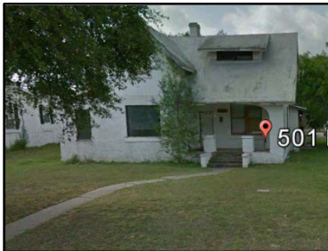
501 E Johnston