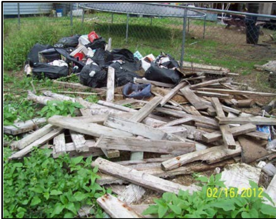
1218 East Huisache