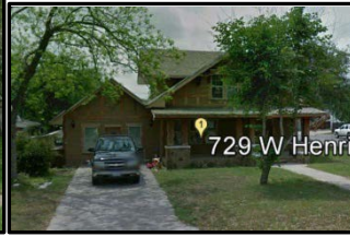
729 W Henrietta