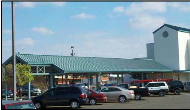
Current Location at HEB (looking NE)