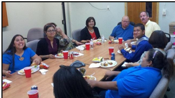
The “Chew Crew” hard at work

wishes all City and County employees much success in the coming years and thanks all employees and elected officials for their support and cooperation over the years