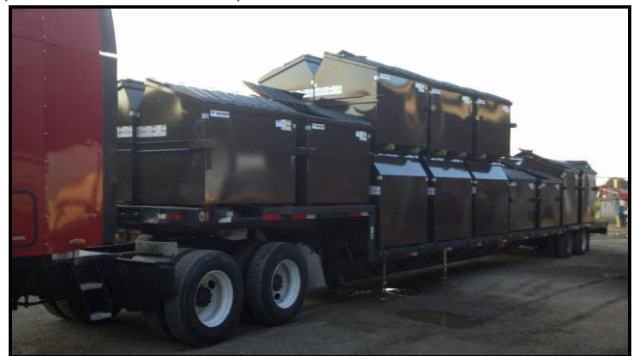
45 new dumpsters being delivered to Sanitation Division.