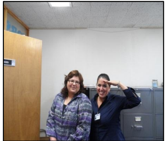
City's New “Training Generals”