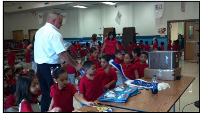
Passing goodies to the students

Landfill Permit Amendment - Director of Public Works, Assistant Director of Public Works and Landfill Supervisor met with the landfill consultant to review and discuss the Constraints Analysis report prepared by the consultant on September 24. Constraints Analysis report is the first step for the permit amendment of the landfill. City staff and the consultants will present this constraints analysis to TCEQ soon.