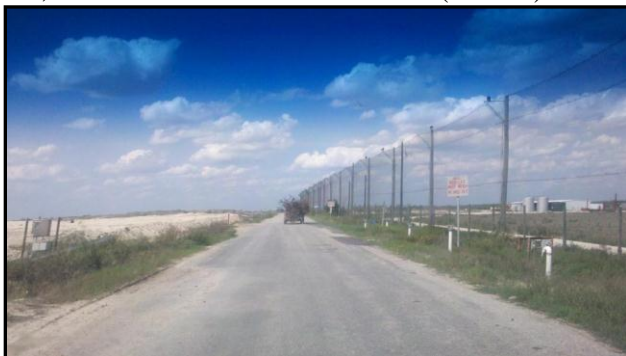
One responsible citizen is taking brush to the City landfill located on E. County Rd.

Municipal Solid Waste (MSW) – 4,044.08 tons; Dead Animals –1.16 tons; Brush – 101.05 tons; Concrete (commercial and residential) – 151.33 tons; Dirt – 245.46 tons; Litter –.23 tons; Metal – 6.28 tons; Construction and Demolition (C & D) – 328.83; Tires – 1.89 tons; Trash-Off – 46.45 tons.