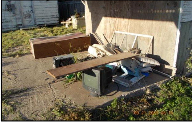
832 East Yoakum-Abated by City Crew 9/21/12