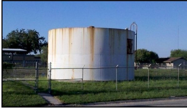
Old water tank