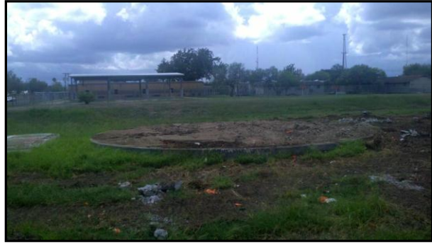
Tank removed, concrete will be removed by the City crews

New Flood Maps on the Way - FEMA arranged an open house at Dick Kleberg County Park Recreational Hall on September 26 to show the new maps and to discuss any related issues with the citizens of Kingsville and Kleberg County.