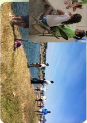
Fish Camp/Angler Education

Teaches kids the life-long sport of fishing while being family oriented, that is not dependent upon a boat. We will show the kids, by following a “hands-on” format rather than a lecture format.