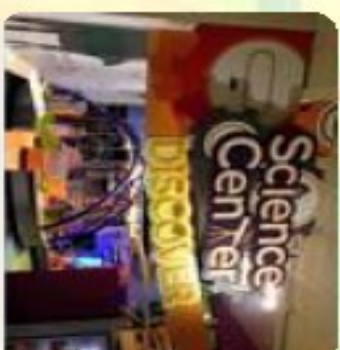
Museum of Science and History

The kids will be joined by certified shot gun and skeet demonstrators. They will also learn safety and good technique.