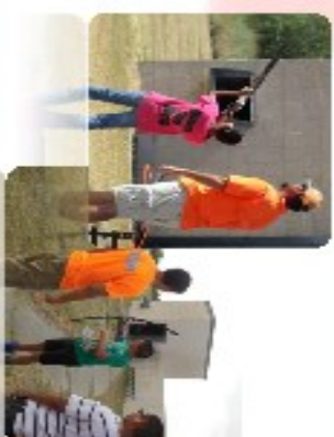
Skeet and Archery

This day will consist of outdoor cooking using a grill. There will also be a cooking competition where teams will face off, similar to “Iron Chef”.