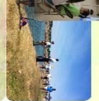
sh Camp/Angler Education

s kids the life-long sport of fishing being family oriented, that is not ent upon a boat. We will show the sollowing a "hands-on" format rather than a lecture format.