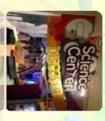
Museum of Science and History

The kids will be joined by certified shot gun and skeet demonstrators. They will also learn safety and good technique.