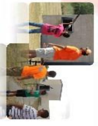
Skeet and Archery

This day will consist of outdoor cooking using a grill. There will also be a cooking competition where teams will face off, similar to "Iron Chef".