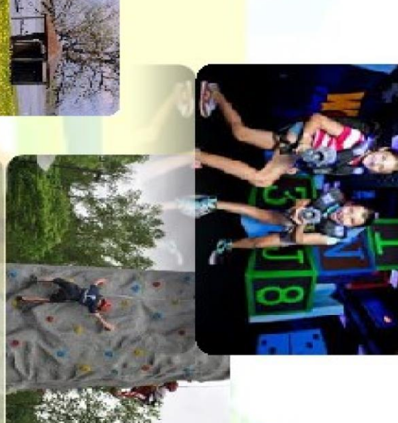
Laser Tag & Rock Wall

This day will consist of outdoor cooking as well as laser tag at the park, and lots of fun on the rock wall.