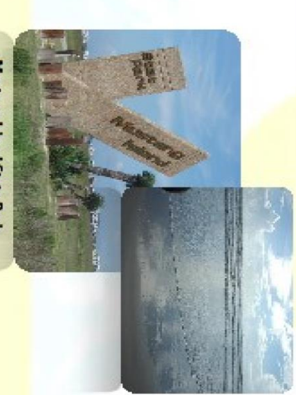
Mustang Island State Park

This day Campers will learn outdoor safety and much more, they will set up actual tens at Dick Kleberg Park.