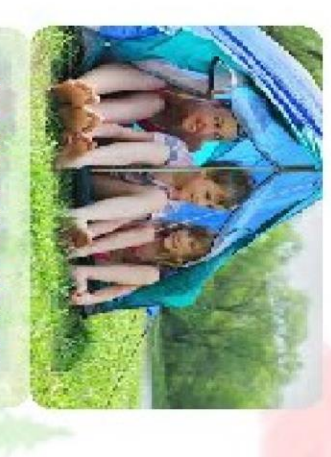
Learn How to Camp Outdoors

Camps & activities are sponsored by Texas A&M AgriLife Extension Service Kleberg-Kenedy County, City of Kingsville, Kingsville Parks Dept., Kleberg County, Brookshire Foundation, South Texas Crime & Narcotics Task Force. This activity is funded in part with Texas Parks & Wild-life Department: Community Outdoor Outreach Program, Keep Kingsville Beautiful Program, & Kleberg County Sheriff's Department