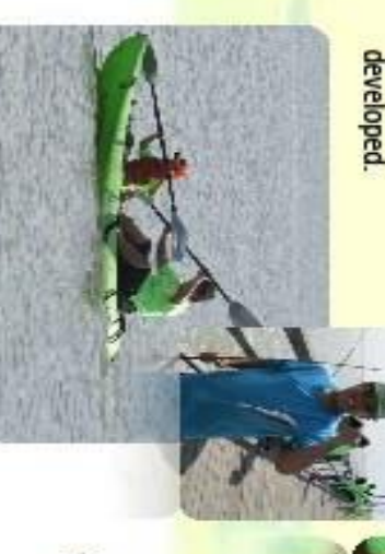
Baffin Bay Fishing and Kayaking

We will walk around the wetlands and take photos of nature, and wildlife. Later in the week we will get some of the photos developed.