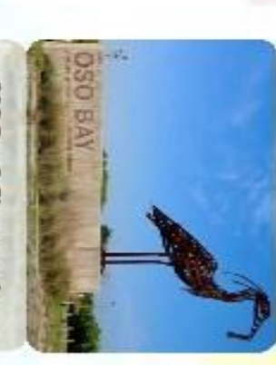
OSO Bay & Photography

We will walk around the wetlands and take photos of nature, and wildlife. Later in the week we will get some of the photos developed.