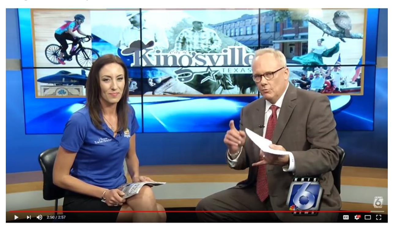
Kingsville hosting numerous events