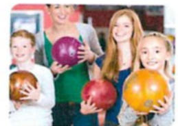
Bowling at NAS Kingsville

This camp will consist of cooking and teaching proper sanitation steps to keep our environment safe for everyone. There will also be a cooking show lunch made by the kids and they will present their recipe to their parents on the final camp day.