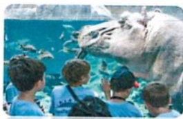
Glady's Porter Zoo

Explore the world you live in! This trip is for children of all ages and they will learn real-world challenges and exploration. We will see science and historic exhibits and much more! This trip will be located in Corpus Christi, Texas.