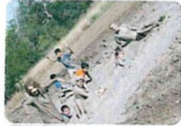
Athletic Week and Mud Run

This week the campers will be participating in outdoor activities such as Pickle Ball, a triathlon, and lastly our Mud Run! The kids will have a blast racing to the finish line through the mud and our obstacle course!