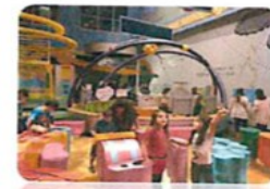
Museum Of Science and History

The children will explore STEM (Science, Technology, Engineering and Math) in fun ways and enable everyone access to STEM education and activities.