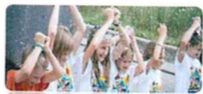
End of Camp Water Games

We will go over the techniques we learned from the angler education, and use them to catch fish while kayaking on Baffin Bay. We will also go over basic “Do’s and Don’ts” of kayak safety.