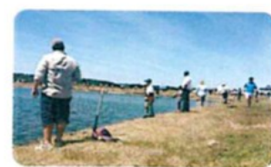
Lake Corpus Christi Fishing and Kayaking

On this day we will be taking a trip to the Naval Air Station in Kingsville to have some fun and celebrate the end of camp. The campers will learn to be patient by taking turns and cheering on one another!