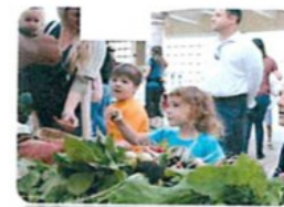
South Texas Botanical Gardens

Get ready to get creative! Campers will be able to take photos outdoors in nature and also get their hands dirty by using clay to create something great! This will also be the week we will have a trip to the Botanical Gardens!