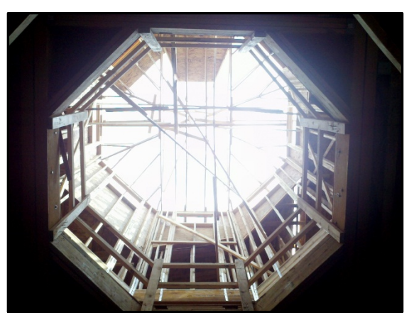
Casa Ricardo tower and atrium