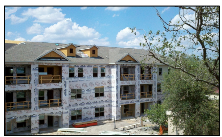
Casa Ricardo takes its final shape