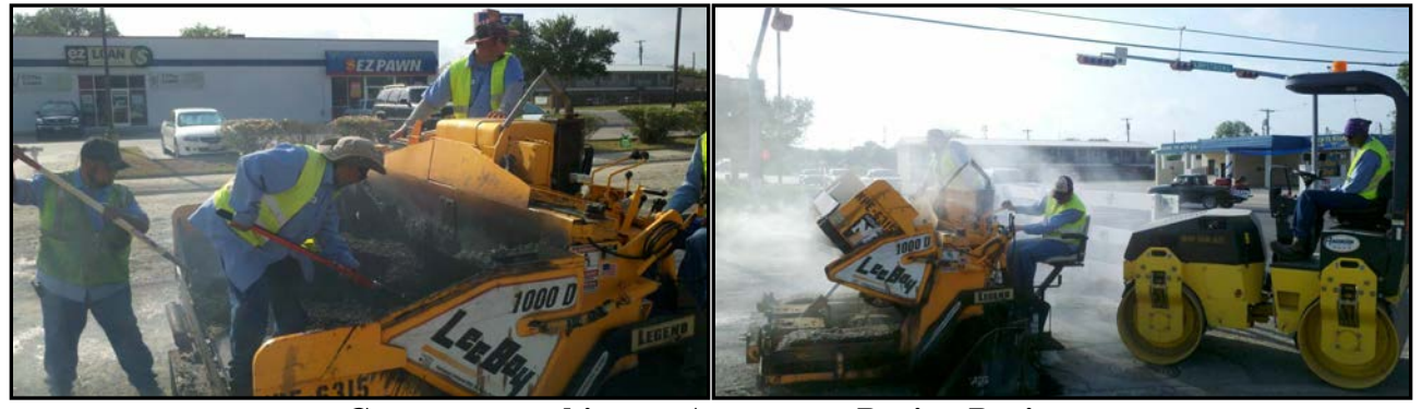
Crews are working on Armstrong Paving Project

Armstrong - Street Division of the Public Works Department commenced with improvements on Armstrong Street on April 12, 2012 as part of a larger 2.4 mile Street improvement project along Ailsie Street (1.3 miles) and Armstrong Avenue (1.1 miles). The total cost of the project is $507, 147 paid from the City's FY 2011 budget surplus. The entire 2.4 mile project should be completed on or before the end of September 2012. Part of Armstrong Street from King Avenue to Huisache Avenue was done on April 27. The current phase of work on Armstrong extends from King Avenue to Yoakum Avenue is done on June 15. Next phase is from Yoakum to Santa Gertrudis. Contractor has installed a storm drain inlet and pipe at Yoakum and Armstrong intersection to resolve the drainage issues in this intersection.