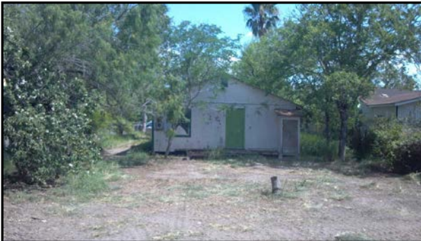
607 W. Caesar