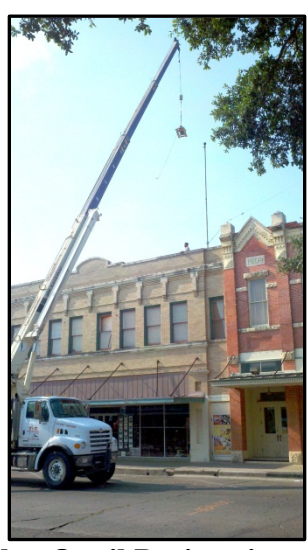
Blue Quail Designs in Flato Building get new AC