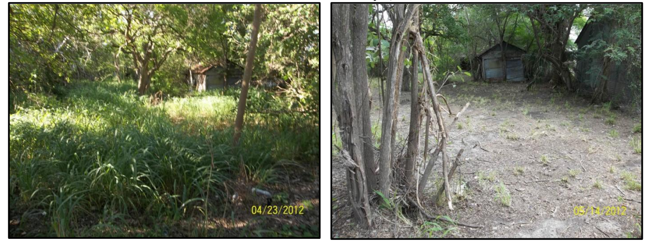
315 East Nettie-Abated May 3, 2012