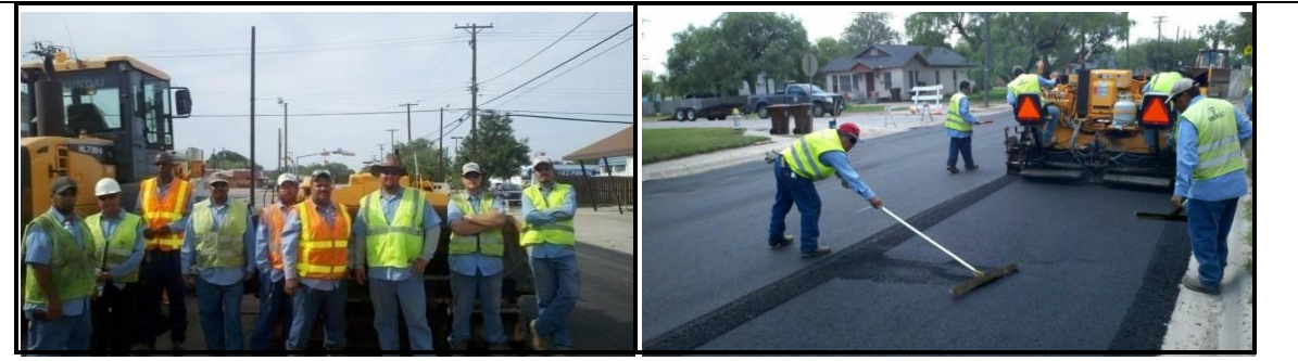
Armstrong Pavement Project crews

Sweeping - Santa Gertrudis from 6<sup>th</sup> to Armstrong, Zone 12 (Caesar to Johnston and 14<sup>th</sup> to 17<sup>th</sup>)