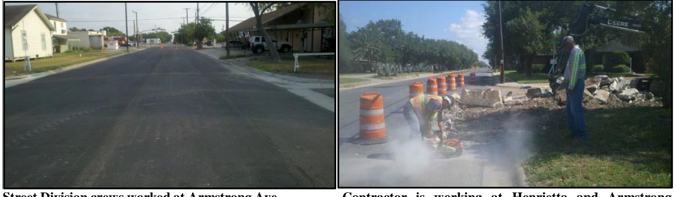
Street Division crews worked at Armstrong Ave.

<u>Armstrong Street Improvements</u> - Street Division of the Public Works Department commenced with improvements on Armstrong Street on April 12, 2012 as part of a larger 2.4 mile Street improvement project along Ailsie Street (1.3 miles) and Armstrong Avenue (1.1 miles). The total cost of the project is $507, 147 paid from the City's FY 2011 budget surplus. The entire 2.4 mile project should be completed on or before the end of September 2012. Part of Armstrong Street from King Avenue to Huisache Avenue was done on April 27. The current phase of work on Armstrong extends from Huisache Avenue to Johnston Avenue is done on May 18. This section of the street will remain closed until May 20<sup>th</sup>. Once this section of the Armstrong is completed, crews will start working from King Avenue to Santa Gertrudis. Contractor is working at Henrieta and Armstrong intersection to improve the drainage issues in this intersection.